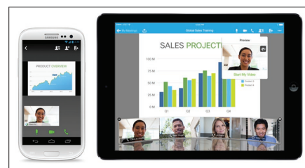
Figure 3. Meet from Any Device

Enjoy a rich meeting experience with audio, video, and content sharing across Android, iPhone and iPad, BlackBerry 10, and Windows Phone 8 devices.